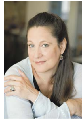
Jayne Anne Phillips

Award and the National Book Critics Circle award in fiction. Phillips is a professor of English and director of the Master of Fine Arts in Creative Writing program, Faculty of Arts and Sciences. Lark & Termite previously was recognized with the Heartland Award. The