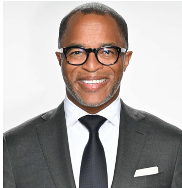
JONATHAN T. CAPEHART Honorary Doctor of Humane Letters

Rutgers University-Newark is pleased to present an honorary Doctor of Humane Letters to Jonathan T. Capehart .