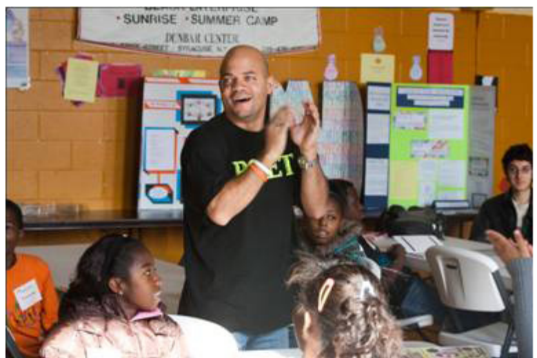
Figure 7.A member of the Syracuse University student poetry group "Verbal Blend" leads a writing exercise in an after-school program under the auspices of Say Yes to Education Syracuse, a precedent-setting, district-wide urban school reform project collaboratively conducted by Syracuse University, the Syracuse City School District, and the Say Yes to Education Foundation.

In four schools and three community locations, Say Yes to Education Syracuse is operating free legal clinics where lawyers give families pro bono advice, service, and referrals in such areas as housing, immigration, and debtor rights. Collectively, Say Yes to Education Syracuse and community partners are working to ensure that children take advantage of available medical insurance programs, enrolling 90% of the students in 18 schools, and setting up physical and mental health clinics in 20 schools.