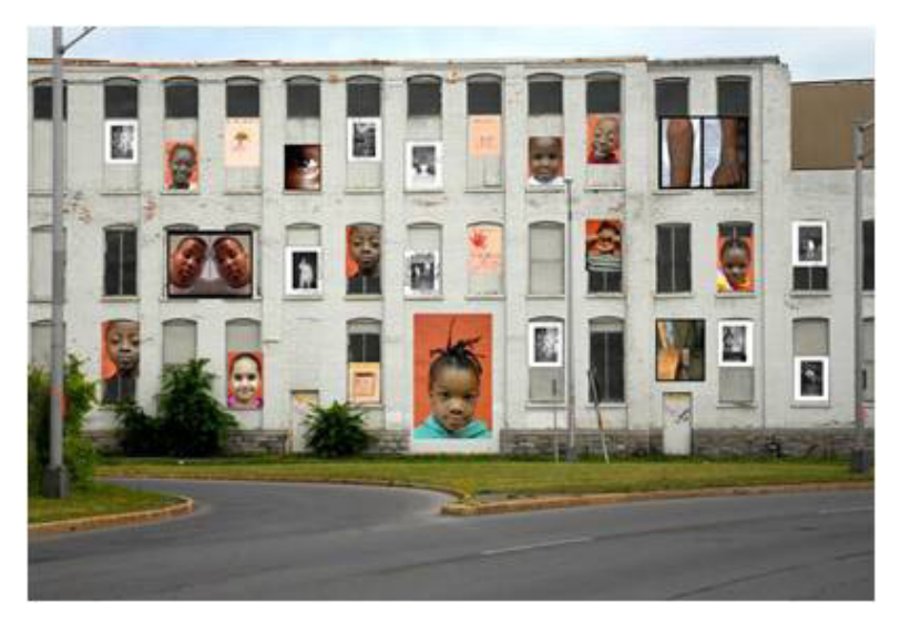
Figure 5. Photo portraits created by schoolchildren of Syracuse's Near Westside signal change in the making, covering one side of the long-vacant Case Supply Warehouse, which the nonprofit Near Westside Initiative is renovating to house regional public television station WCNY and ProLiteracy, the world's largest literacy organization, which is based in Syracuse.

literacy organization, ProLiteracy International, and soon will house WCNY, the region's public television affiliate—two organizations whose missions in communications and education speak directly to the 21<sup>st</sup> century challenge and promise of tapping the vast pool of talent in neighborhoods such as the Near Westside. Other businesses that have relocated to the neighborhood or started there since 2006 include an architecture firm, a recording studio, a coffee shop, a fitness center, and a bakery. To support continued development and growth of the 140 businesses already in the neighborhood, the Near Westside Initiative has helped organize a business association.