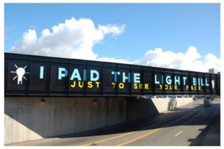
Figure 3. One of the six murals painted on old train trestles in Syracuse's Near Westside neighborhood by celebrated graffiti artist Steve Powers that have turned perceived barriers into gateways.

A Love Letter to Syracuse is meant to be from Syracuse to Syracuse. We found as we were painting it, it is also to industry, to the trains that pass over the bridges, to the act of painting hot steel in the summer, to collaboration, to polite drivers, and especially to improvisation ( Powers, 2010 ).